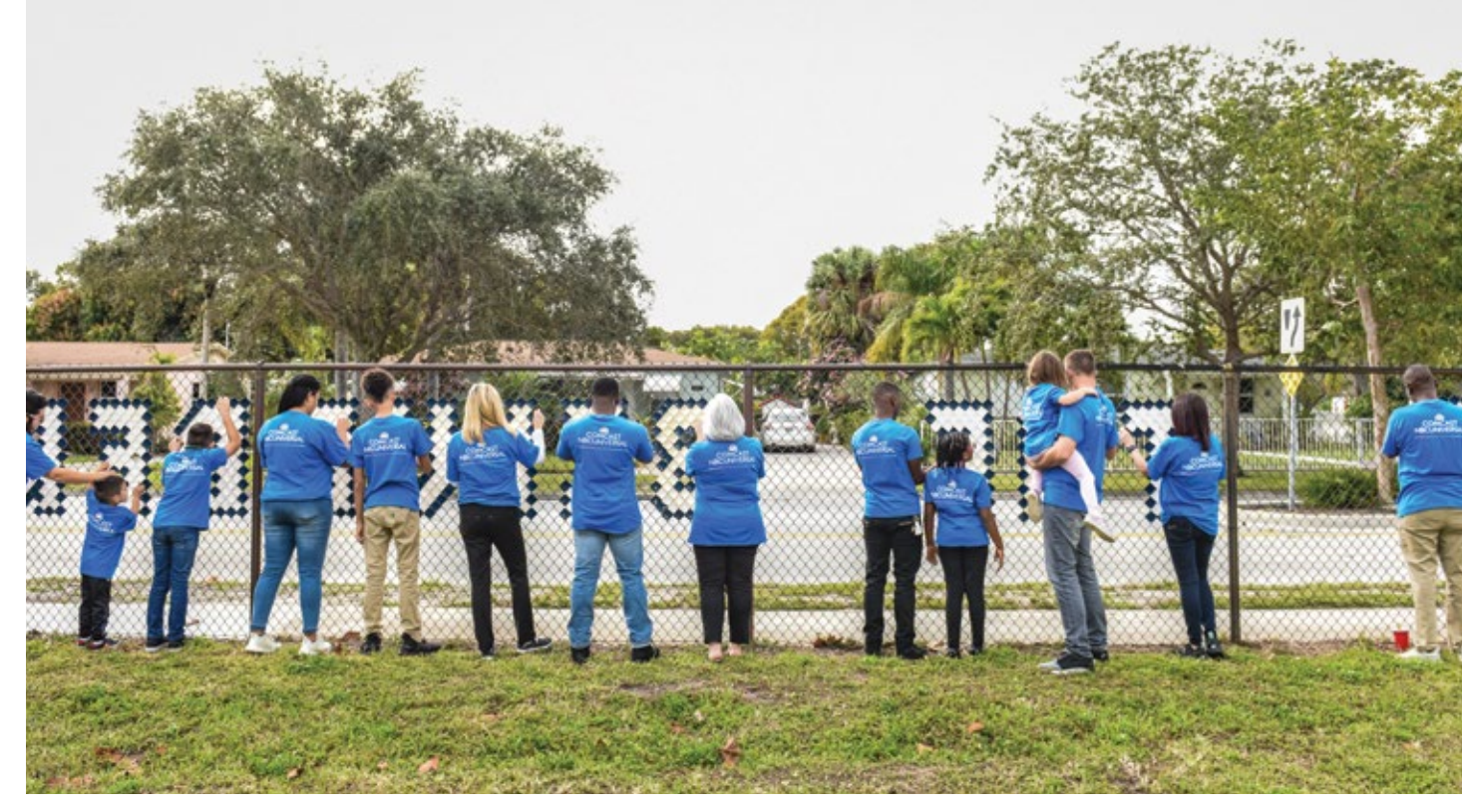
The Most Impactful Employee Volunteer Programs You Need to Know About | 4

Employees, their friends, families and community partners have contributed more than 6 million hours of service to more than 10,000 projects